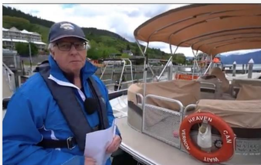
Video 2 - Safety Equipment